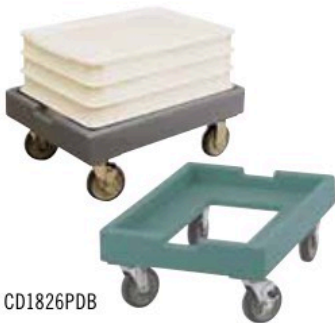
CD1826PDB Weight Capacity: 300 lbs.